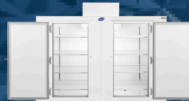
S100 AS INDOOR & OUTDOOR

For Restaurant, C-Store, and business owners alike looking to maximize their revenue generating space, Leer's Reach-In Storage Freezers offer a versatile solution to their storage needs by offering customized units that feature small footprints but large capacities.