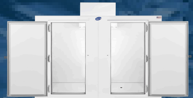
S100 INDOOR & OUTDOOR

For Restaurant, C-Store, and business owners alike looking to maximize their revenue generating space, Leer's Reach-In Storage Freezers offer a versatile solution by offering customizable and fully weatherproof outdoor units.