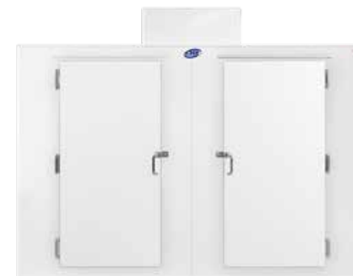
INDOOR REACH-IN STORAGE FREEZERS

For Grocery Stores looking to maximize their revenue generating space or simply need more cold storage, Leer's Refrigerated Reach-In Storage units offer a versatile solution by offering customizable and fully weatherproof units either with or without shelving.