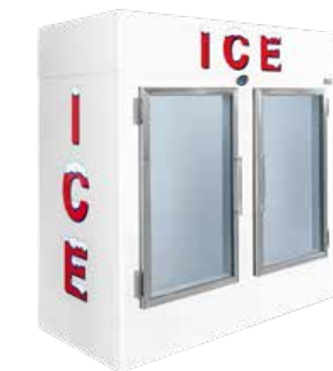
INDOOR ICE MERCHANDISERS

If your Grocery Store sells ice look no further. Leer is the industry leader in innovation, quality, lead-time and reliability across our lineup of customizable indoor and outdoor Ice Merchandisers.