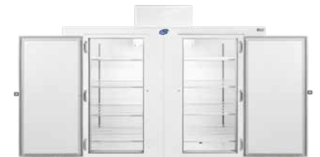
OUTDOOR REACH-IN STORAGE FREEZERS