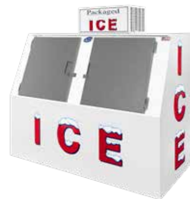
OUTDOOR ICE MERCHANDISERS