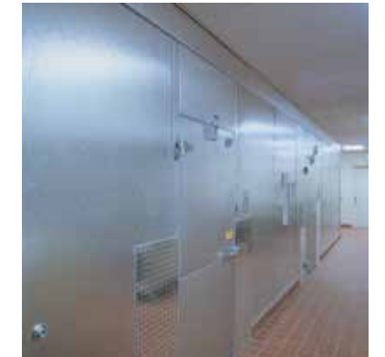
WALK-IN COMBO BOXES